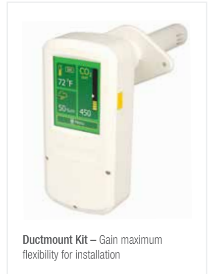
Ductmount Kit – Gain maximum flexibility for installation