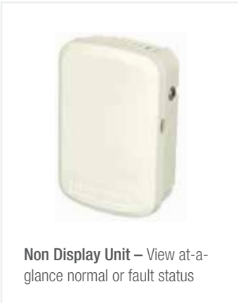
Non Display Unit – View at-a-glance normal or fault status

USB Port – Update display graphics with logo and contact information; allow future uploads of product enhancements